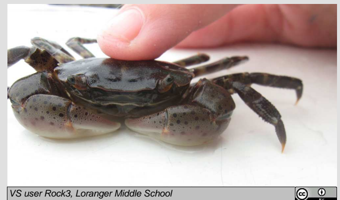
The Asian shore crab often has spots on its claws. Sometimes they can be bright red!