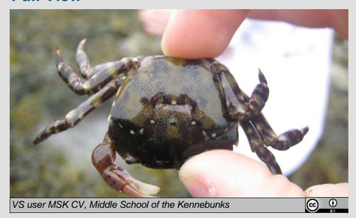
Look for a crab with a square shell and banded legs.