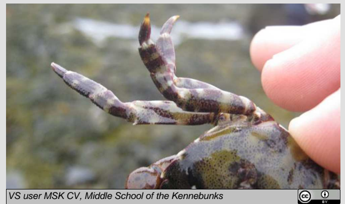
Look for light and dark-colored bands on the legs. Look for a fleshy bulb-like structure on the claw (between the pinchers).